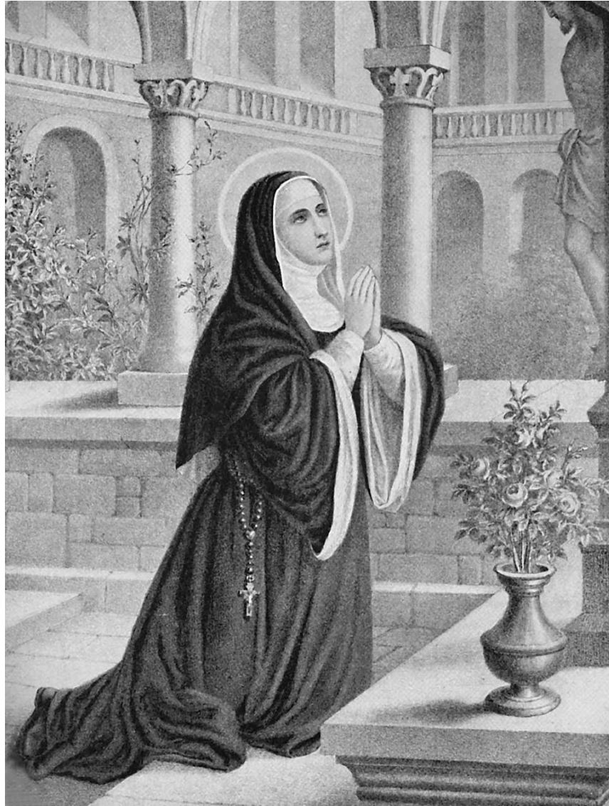
St. Gertrude, 19th century lithograph

BORN 1256; DIED 1301 OR 1302 VIRGIN AND RELIGIOUS FEAST DAY: NOVEMBER 16