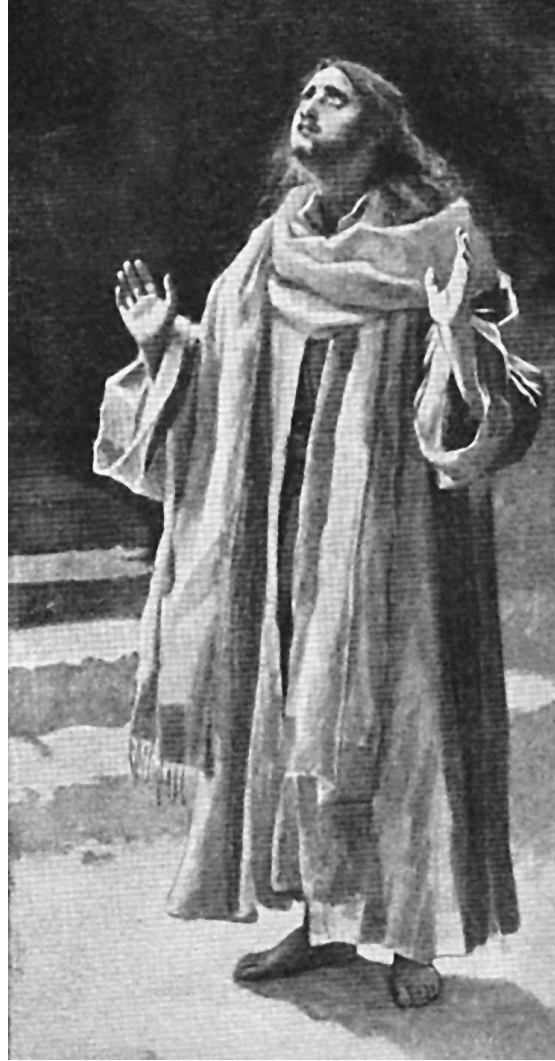
St. John, by James Tissot, 1856-1902

Throughout the Gospels, Simon (later renamed Peter by Jesus), James, and John re-